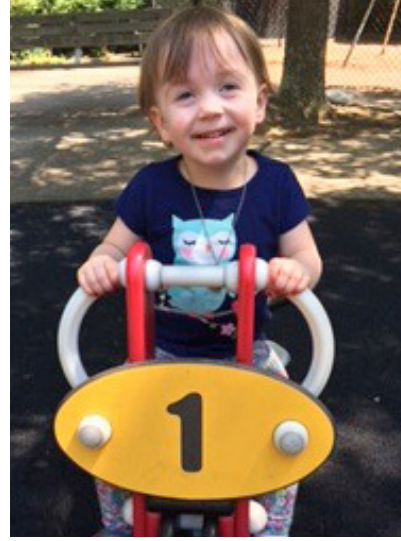
Installation of the new playground equipment is scheduled to begin in the fall!

DETAILED INFORMATION FOR ALL ACTIVITIES CAN BE FOUND AT THE RECREATION CENTER OFFICE OR ON THE RECREATION CENTER WEBSITE AT WWW.RVCREC.WEBLY.COM