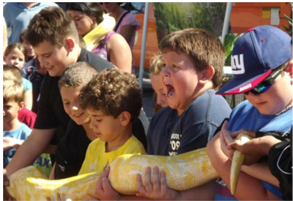
Come down for the annual KIDS'FEST on September 17th. Kids can enjoy rides, face painting and a variety of exhibits and demonstrations including Erik the Reptile demonstration.